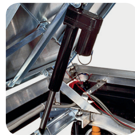
Electric Bed Lift