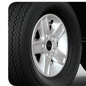
5-Spoke Wheel Cover