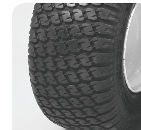
Extra-Traction Turf Tires