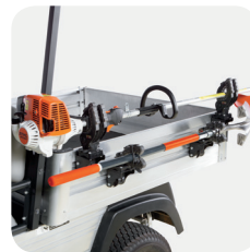
Secure expensive power tools, protecting them from transit damage