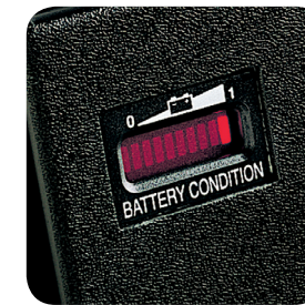
Battery Capacity Indicator