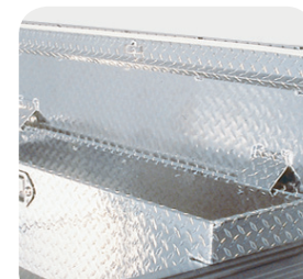
Cargo Tool Box