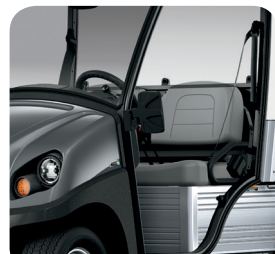
Cab Outside Mirrors