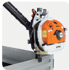
A variety of equipment—cleats, hooks, clamps—is available to fit tools and cargo