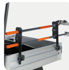
Reinforced aluminum channels can handle almost any load