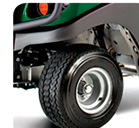
Small Wheel Package