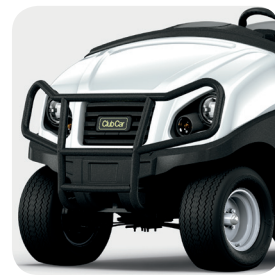
Heavy-Duty Brush Guard