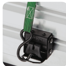
Add/remove/relocate clamps and tie-downs to fit your cargo