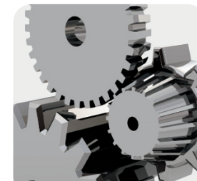
Limited Slip Differential