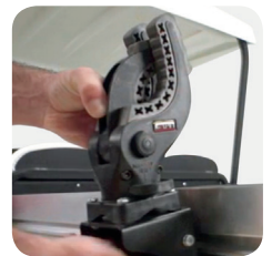
Attachment clamps are injection molded for solid fit and dependable performance