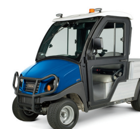
ROPS Cab (Front Hinge Door)