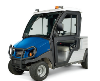
ROPS Cab (Front Hinge Door)