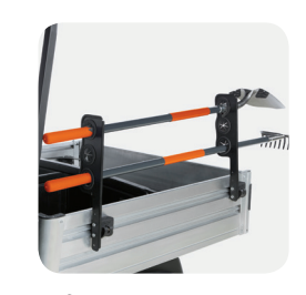
Reinforced aluminum channels can handle almost any load