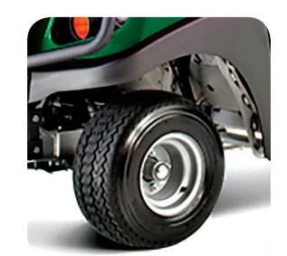
Small Wheel Package