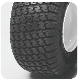
Extra-Traction Turf Tires