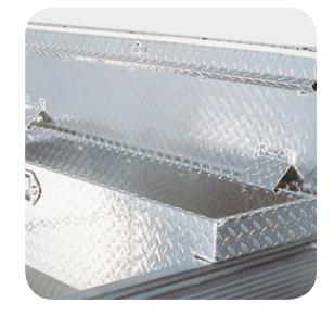
Cargo Tool Box