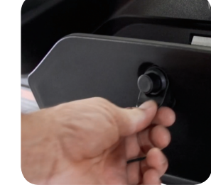
Locking Glove Box