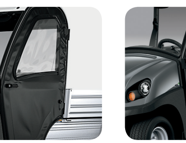
Cab Outside Mirrors