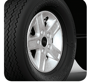
5-Spoke Wheel Cover