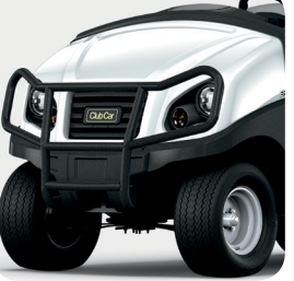
Heavy-Duty Brush Guard