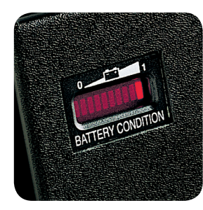
Battery Capacity Indicator