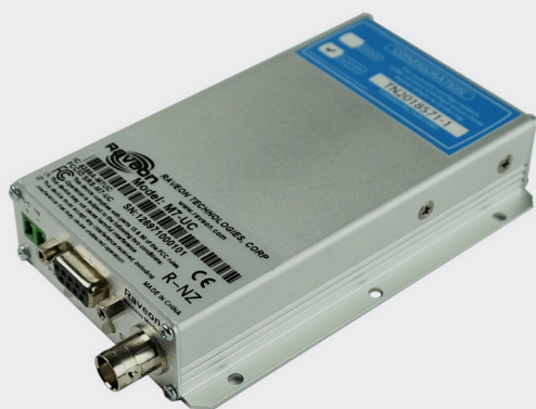
Raveon M7-UC UHF Digital Radio